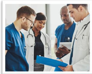
Doctors and Nurses

People work in the local community help others everyday.